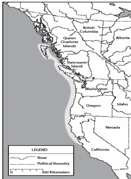
Figure 1. Geographic Range (light shading) of Southern Resident killer whales (Wiles 2004).

Southern Resident killer whales are listed as endangered under the U.S. Endangered Species Act. The population has 88 members, and a variable productivity rate. Several factors identified in the final recovery plan for Southern Residents may be limiting recovery (NMFS 2008). These are quantity and quality of prey, toxic chemicals that accumulate in top predators, and disturbance from sound and vessels. Oil spills are also a risk factor. It is likely that multiple threats are acting together. For example, disturbance from vessels may make it harder for the whales to locate and capture prey, which may cause them to expend more energy to catch less food. Although it is not clear which threat or threats are most significant to the survival and recovery of Southern Residents, all of the threats identified are important to address.